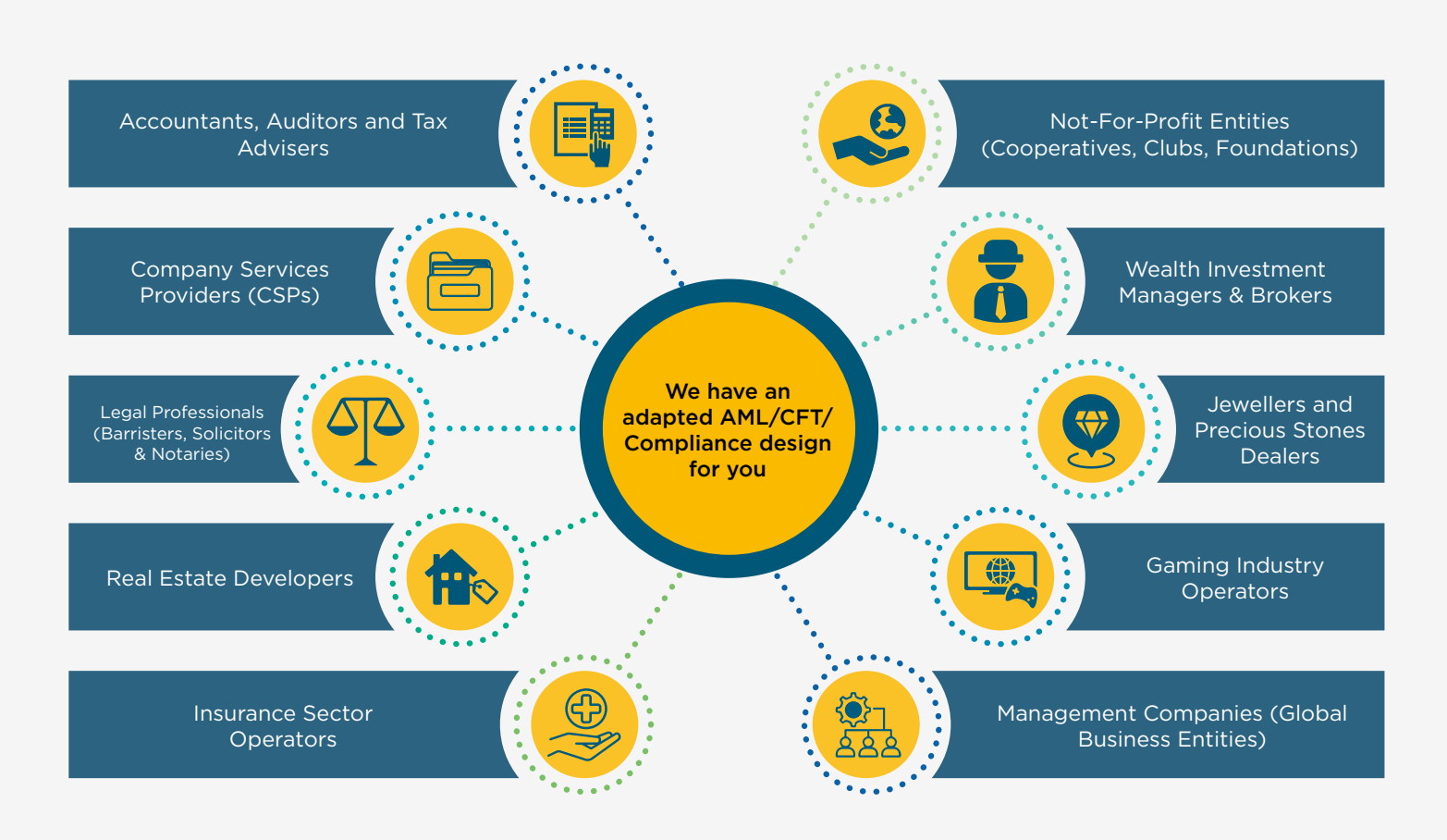
If you operate in one of the above sectors, you need to talk to HLB Mauritius!

All Management Companies and Designated Non-Financial Businesses and Professions (DNFBPs) are required as per the latest Anti Money Laundering Legislations and Regulations to implement and adopt an AML/CFT Risk-Based Programme.