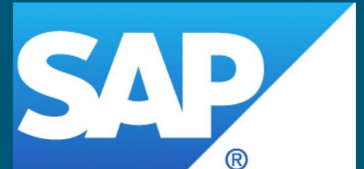
A worldclass ERP